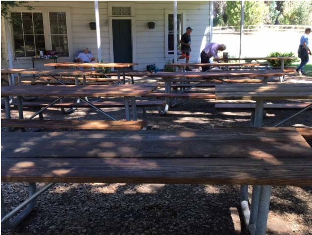
The finished product! All 10 picnic tables refurbished and ready for the next event!

The Granite Rock Fundraiser for Quail Hollow Ranch will be held on October 13 th 10 – 1:00 at the Granite Rock Quarry in Felton. Tours and Tacos for a $10 donation.