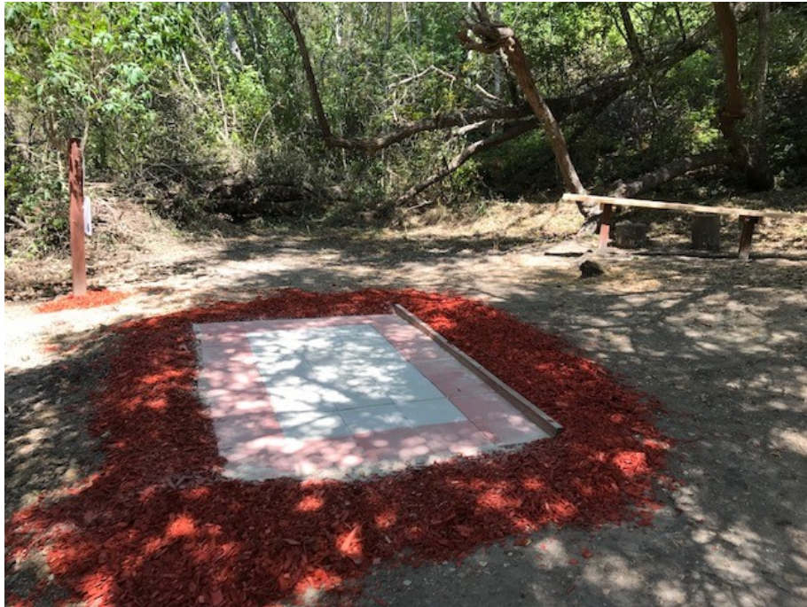
The finished product! Thank you Volunteers!

On September 22 Mountain Bikers of Santa Cruz organized a volunteer event for the new Bike Pump Track at Pinto Lake Park. There were over 26 volunteers from the Mountain Bikers of Santa Cruz, and Project Bike Tech. The volunteers helped spread mulch, installed erosion control material, dug troughs, and moved rocks.