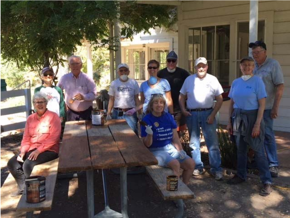
The group! Thank you!