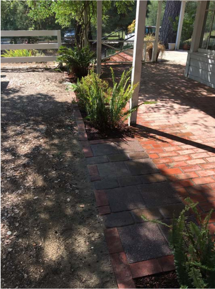
The new pathway to the picnic area.