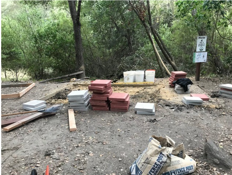
Material and prep for the new Tee on Hole 4!

Pinto Lake volunteers made a new tee for hole 4 on the Disc Golf Course. In August, volunteers logged over 20 hours keeping the course clean and ready for play, controlling weeds, and on graffiti abatement.