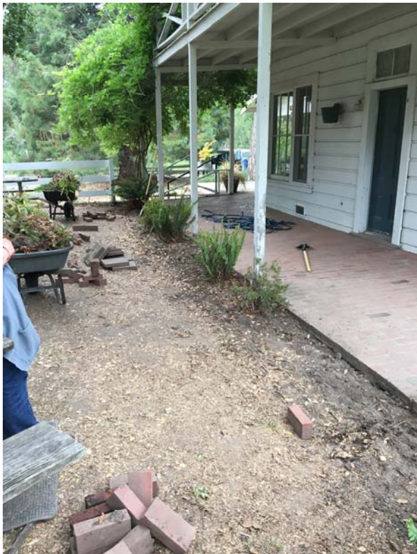
At the beginning of the project.

Two SLV Rotary members volunteered their time to renovate a planter area at the Quail Hollow House. They set a drip irrigation system, planted additional ferns, created a large pathway to the picnic area, spread mulch, reset the brick border, and cleaned up the existing plants. It looks beautiful!