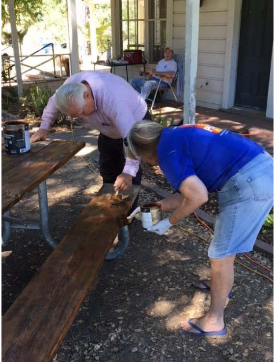
Applying finishing product

The San Lorenzo Valley Rotary Club volunteered at the ranch on a Sunday morning and sanded and finished the 10 the picnic tables we use for events. They look fresh and clean.