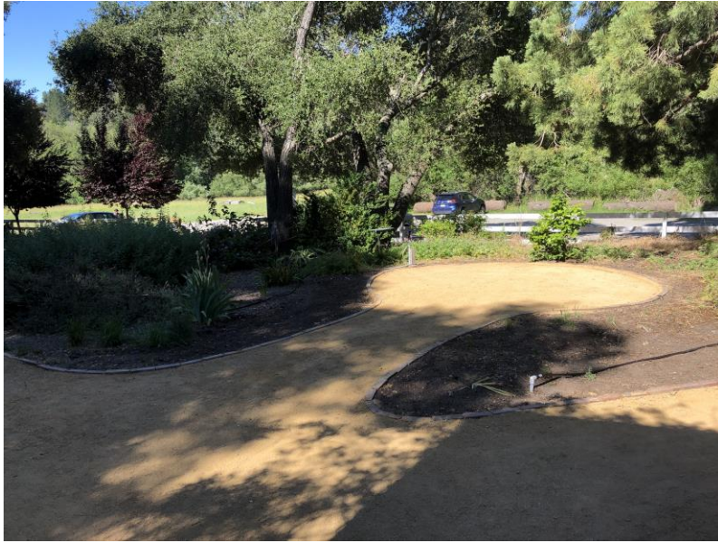
New hardscape design.

Friends of Quail Hollow also funded a large portion of the split rail fence on the Discovery Loop.