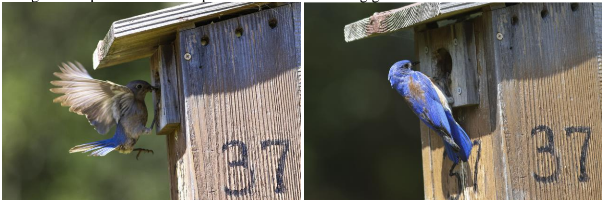
A pair of Western Bluebirds have made box 37 their home to raise their chicks. Left picture is the female and on the right is the male, both feeding their chicks.

The Nest Box Program started on March 1 st . They are continuing to record activity but have changed their procedures to adopt to the Social Distancing guidelines.