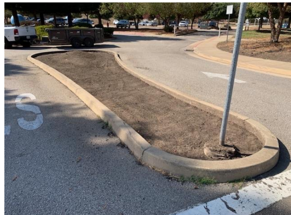
WORKING ON THE ENTRANCE AT AJ